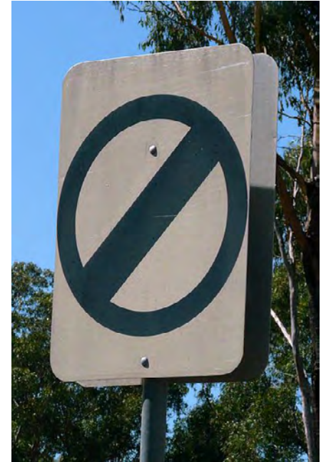
Speed Derestriction Sign