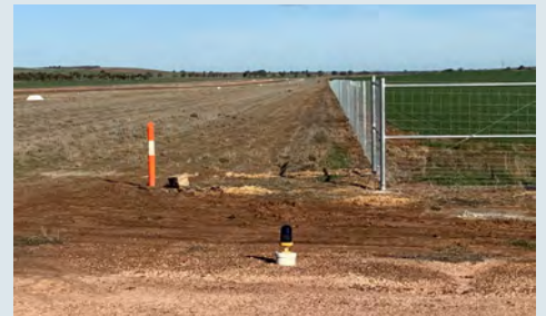
Booleroo Centre Aerodrome Fencing Upgrade

March 2023 marked a significant milestone for the Booleroo Centre Aerodrome, as it celebrated its 25th year since construction in 1998. This anniversary is a testament to the spirit of the community, where farmers from across the district, along with the council, pooled their heavy machinery and skills to create a vital aviation hub. The construction of the airstrip stands as a remarkable testament to the power of collaboration, embodying the spirit of achievement through unity. This colossal community endeavour, one of the largest in recent history, showcases the remarkable results that can be achieved when our community works together towards a shared goal. The inspiring story of the Booleroo airstrip's inception and construction will be featured in the next edition of Council's community newsletter.