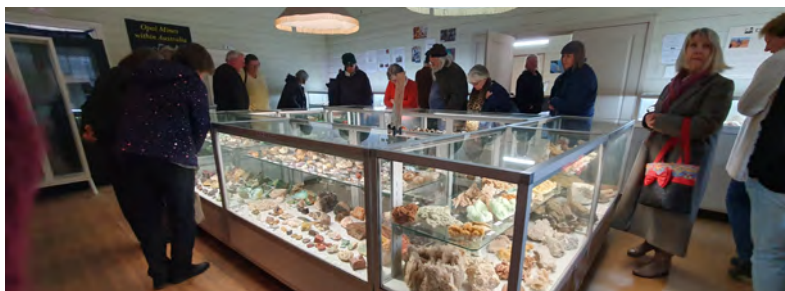
Views from inside the Wilmington Gem Museum