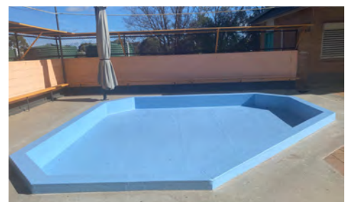
Toddler's Pool Completed