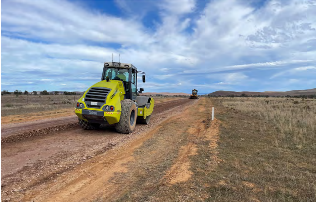
Wilmington Road Re-sheeting