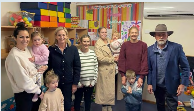
Wilmington Childcare Working Group with Angie Bell MP and Rowan Ramsay MP

By championing the cause of accessible childcare services, the Wilmington Childcare Working Group aims to support our community's families and enable parents to pursue their careers without compromising their children's wellbeing. With continued support from the community and stakeholders, we can work together to create a thriving childcare environment in our district.