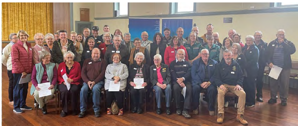
National Volunteer Week Morning Tea Celebration Group Photo