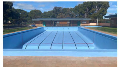
Main Swimming Pool Completed

Council is committed to providing a remarkable swimming experience for the community, and the pool will be ready for use at the start of the 2023/2024 Summer season in November. Council acknowledges the work of the contractors for their great work, and also the ongoing support provided by the many volunteers who assist in the running and maintenance of the pool facilities.