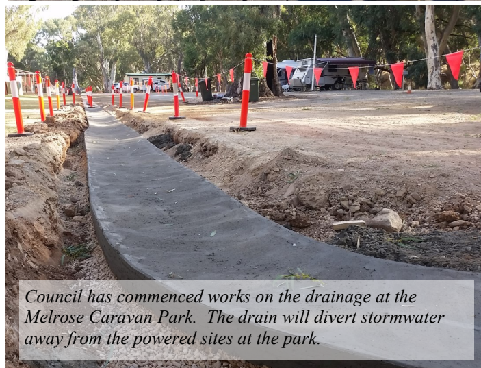
Council has commenced works on the drainage at the Melrose Caravan Park. The drain will divert stormwater away from the powered sites at the park.