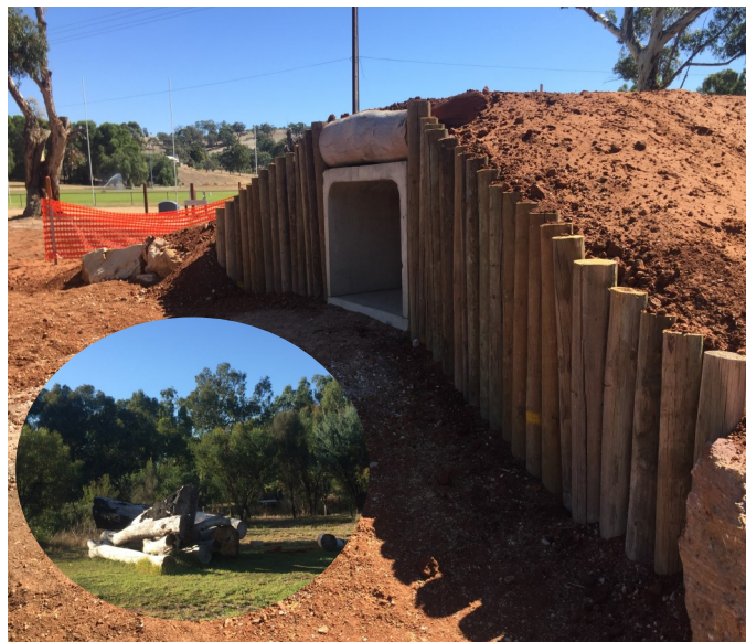
Logs from the fire ravaged Wirrabara Forest will be used in the Wirrabara Nature Play Park.

Until sufficient rainfall is received for Council to carry out its programmed grading, road users are encouraged to drive to the conditions and be aware of their surroundings as the nature of unsealed roads have changing conditions and can be unpredictable.