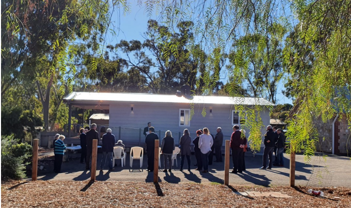
The Bluff Lookout, increasing investment in Rail Trails this investment in the new cabins will also contribute to a sustainable future and vibrant economy for the broader district.

Council believes that with development of the Remarkable Southern Flinders Precinct, investment in the new cabins will also contribute to a sustainable future and vibrant economy for the broader district.