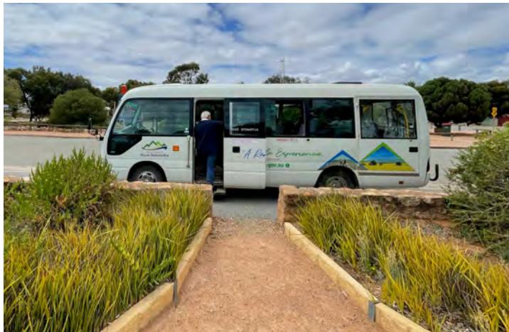
The Bus at Port Germein