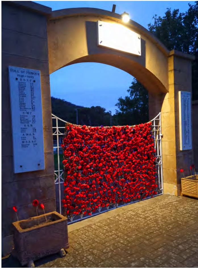
Melrose gate of honour