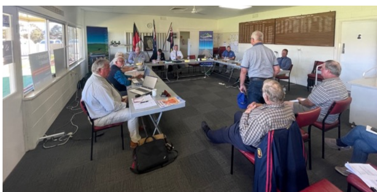
November Council Meeting held at Booleroo Centre Bowling Club