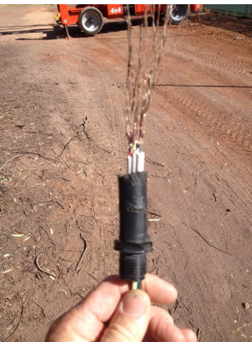
Above - electrical wires damaged by the corellas to lighting at community recreational facilities.

The report confirms there is no quick fix to the Corella issue and in general Corellas are here to stay. The report includes long, medium and short term management of the corella and has established that we have created the perfect habitats for the bird with abundant water and food sources, large open spaces and treescapes.