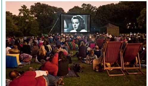
The Wirrabara Community Development Tourism Group received $4090 in Round 1 for a projector and screen for a pop-up cinema. The pop-up cinema has been well supported and is a positive initiative of the community.