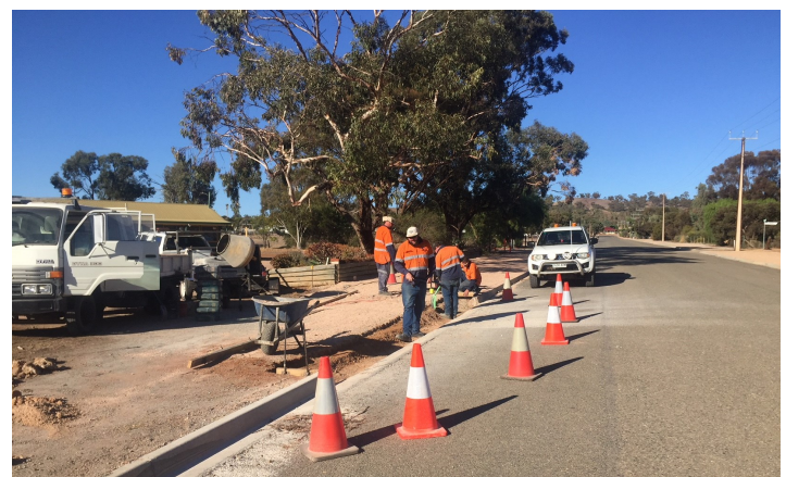
Annually Council allocates resources towards roads, kerbing, water table & footpaths. Drainage and kerbing has been completed on Whitby Street Melrose during April.

Council has completed footpaths, culvert and paving at the Wilmington cemetery, commenced works on a new Niche Garden at the Port Germein Cemetery and engaged a contractor to replace the shelter at the Wirrabara Cemetery as part of the Capital Works Program of the 2017-2018 Annual Budget.