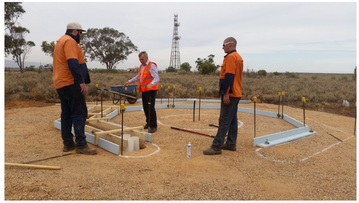
The Port Germein Cemetery Niche Garden design and preparations for the cement pour are in place. The niche garden is expected to be completed during May.

Council will continue to use the gas guns with the support of the local communities of Melrose and Wilmington. Ratepayers who wish to discuss this action or have concerns can contact Council on 8666 2014.