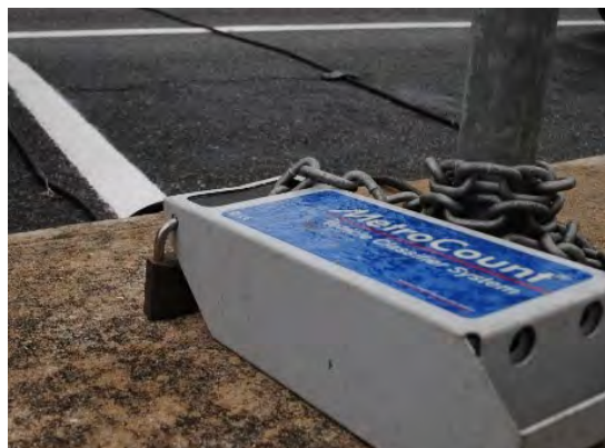
The Bluff traffic counter in action.