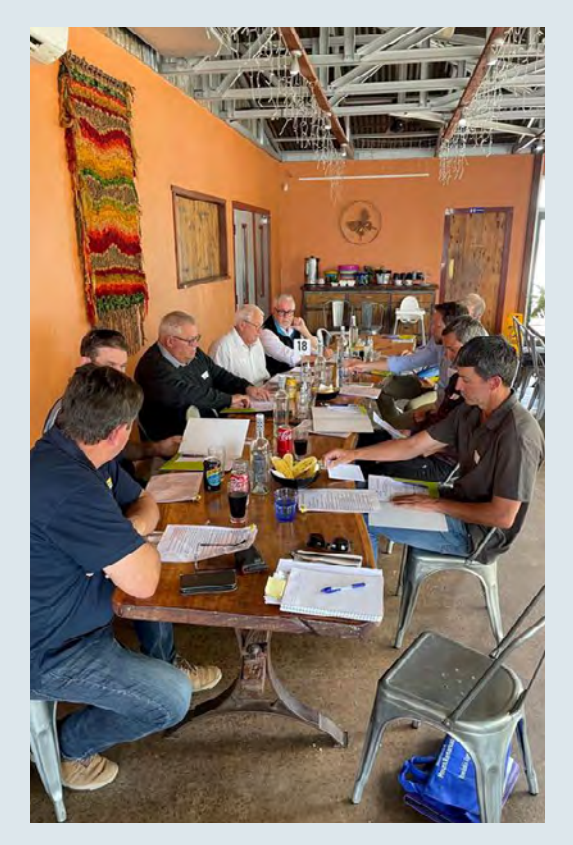
The Mayor's Business Lunch was a great success and was well received by the attendees.

Council will continue to develop its offerings in the business and economic development space by enhancing and continually building on the information about the District that specifically aligns with existing and future business opportunities.