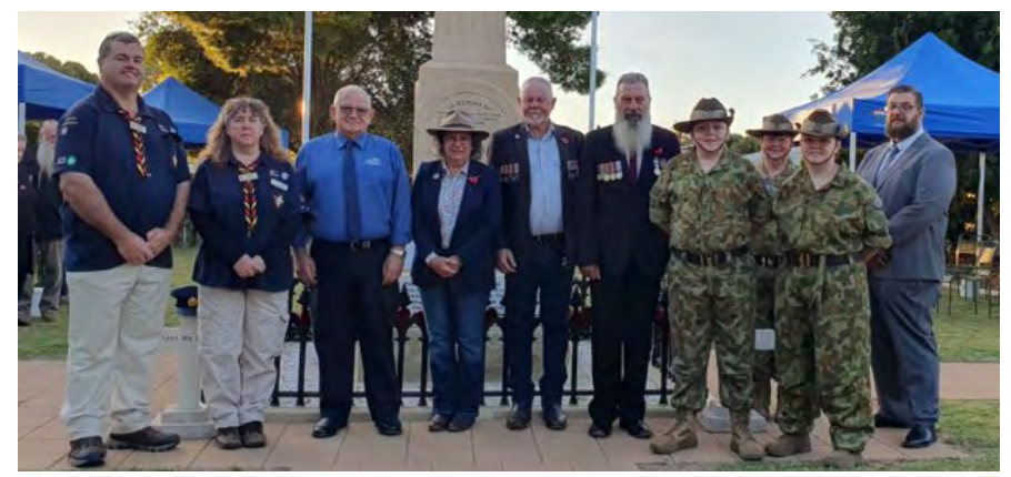
Port Germein Service