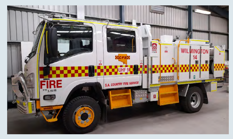
The new Wilmington CFS appliance

The crew has commenced familiarisation of the new appliance and is looking forward seeing how it performs on the fireground.