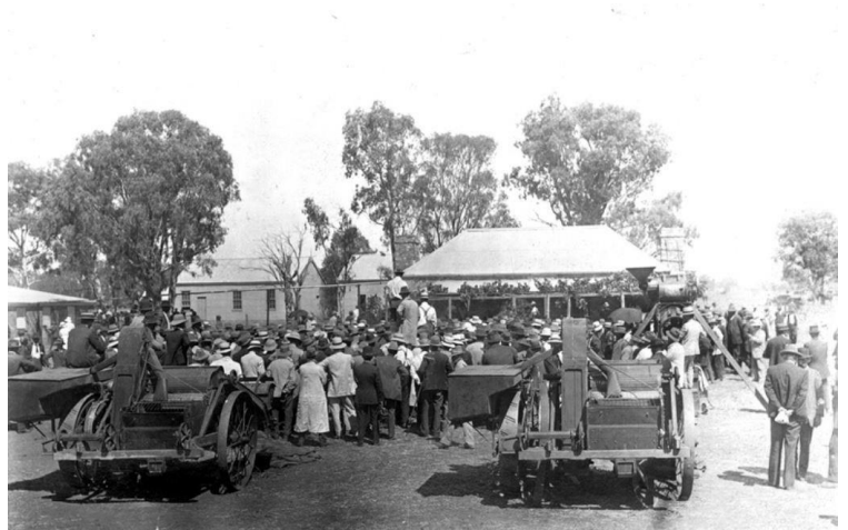
State Library of South Australia PRG 280/1/12/296