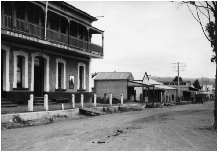
State Library of South Australia B8560