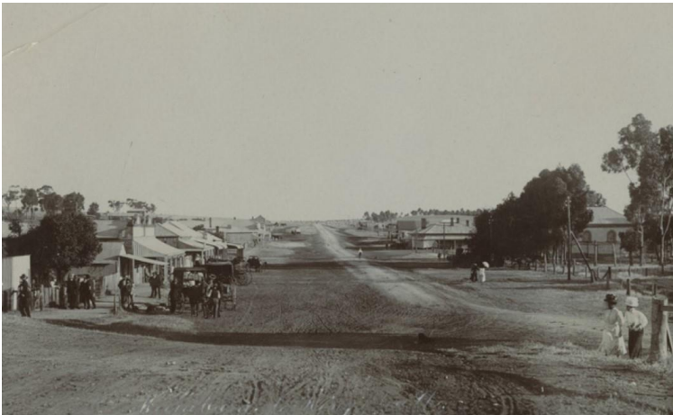
State Library of South Australia B43569