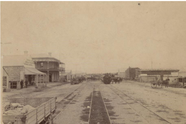
State Library of South Australia PRG 373/7E/1/1