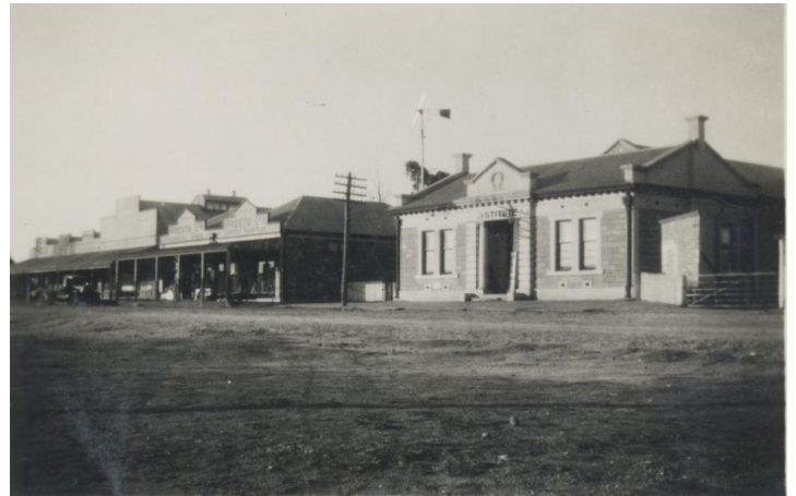
State Library of South Australia B63718