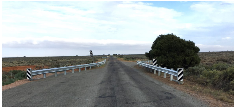
Guard Rails have been installed to the recently completed Spear Creek Bridges as part of the Bridges Renewal Programme.

Council have been successful in obtaining funding from the Department of Planning, Transport and Infrastructure, that will see the realization of the 'Jewel of Beautiful Valley; A Framework for the Revitalisation of Wilmington'. Within the framework there were projects listed as Wilmington's Core Areas or Action Areas. The project will include kerbing and protuberances, landscaping, parking, defined walking spaces, access ramps, paving and irrigation and will continue with the theme of the existing upgraded protuberance. Council is confident the project when completed will create and provide a safer environment, allow people to move easily and safely across the wide road and improve the amenity of the Wilmington Main Street. The scope of works and project are available for viewing at the Council Office on the website www.mtr.sa.gov.au or at the Wilmington Post Office.