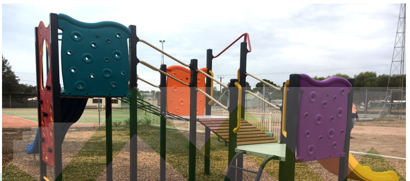
Council worked with the Port Germein Tennis Club to replace the equipment at the playground adjacent the Port Germein Tennis Club. This exciting new piece of equipment ensures the play area is compliant for Work Health & Safety standards.