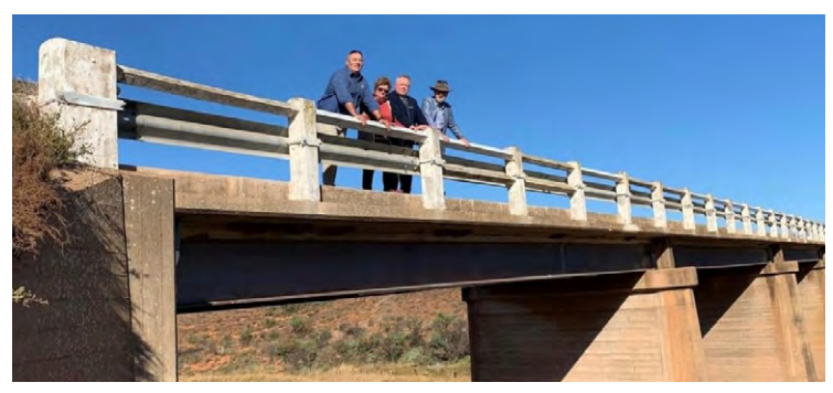
Visiting Pine Creek Bridge - Mount Remarkable Mayor Phillip Heaslip, Cr Denise Higgins and Mayor Ben Browne (Northern Areas Council) with Member for Grey Rowan Ramsey MP.

Council welcomes the announcement and thanks the Federal Government for its commitment in this much needed investment.