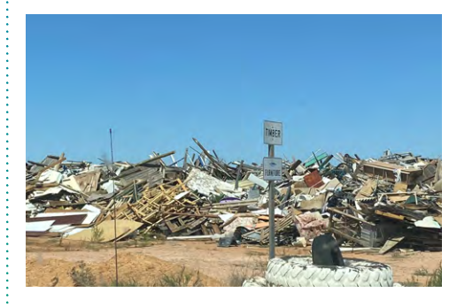
Existing waste stockpiled at Willowie site

The Transfer Station will process and remove 100% of the waste collected at the site and transfer to other waste facilities to separate and fully recycle.