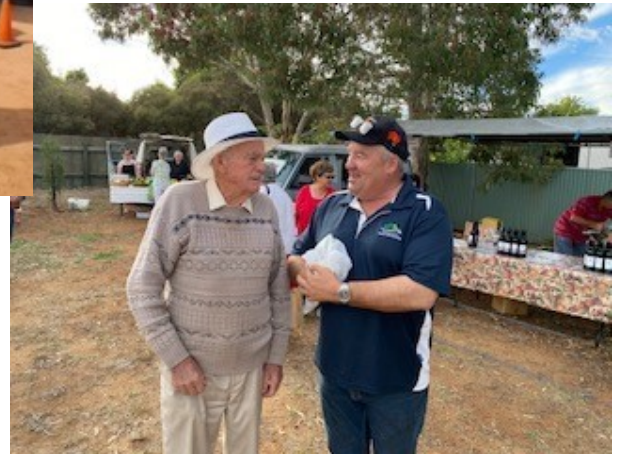
Council representatives visited the Booleroo Centre Sheep Races event and the Wirrabara Producers Market. Pictures shown meeting with some local residents.